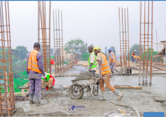
Workers preparing concrete for sections 1,2 & 3

Concreting team feeding the mixer machine with concrete, carefully mixing cement, sand, and ballast to ensure the concrete achieves the strength and durability needed for the structure.