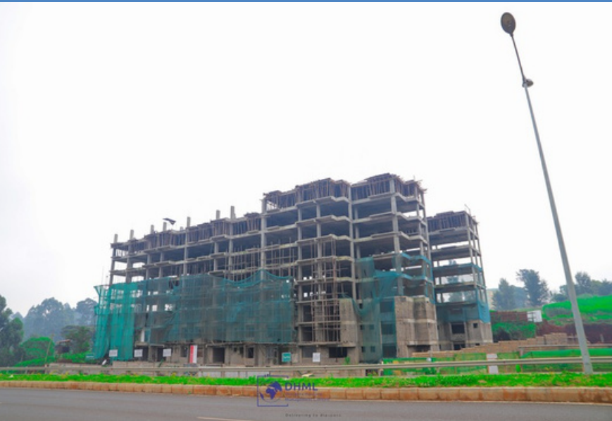
Front elevation and rear view of the first 100 units of the Iconic Fanisi Tigoni View Phase I