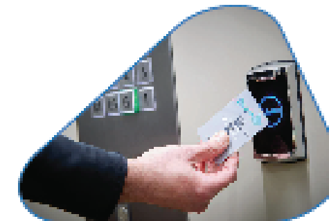
Card access at the lift