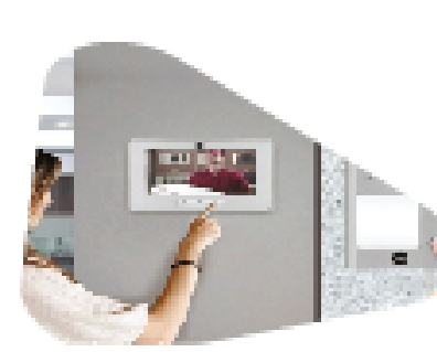
Intercom at the gate